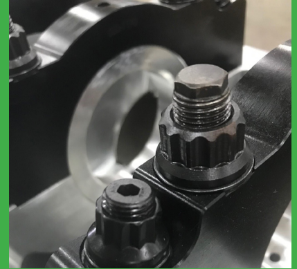
9/16 Inner Main and 1/2 Outer Main Studs.