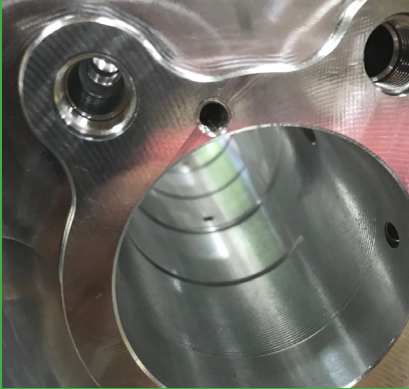
Enclosed Cam Tunnel with Internal Drain.