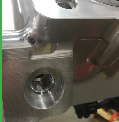
Lifter Valley/Cam Tunnel Scavenger Drain Fitting.